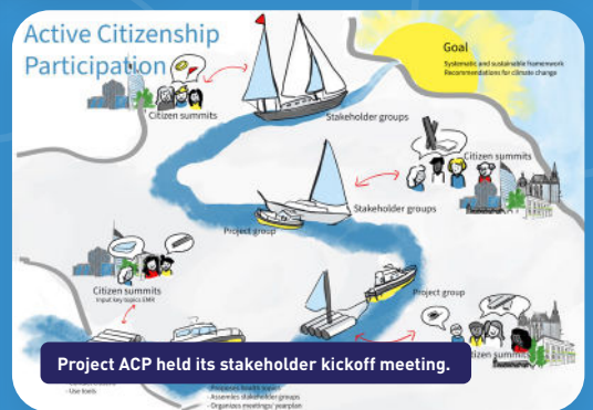
Project ACP held its stakeholder kickoff meeting.