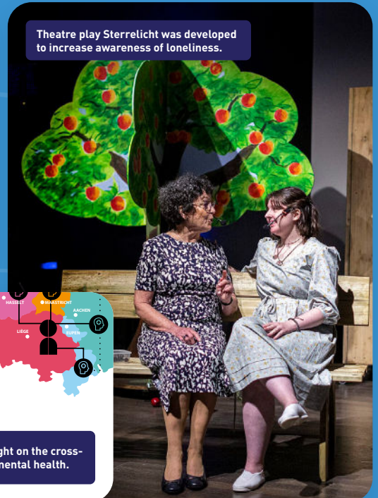
Theatre play Sterrelicht was developed to increase awareness of loneliness.