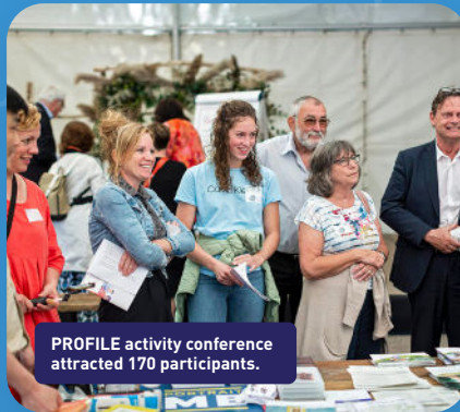
PROFILE activity conference attracted 170 participants.

SoMe (Social Networks and Mental Health)